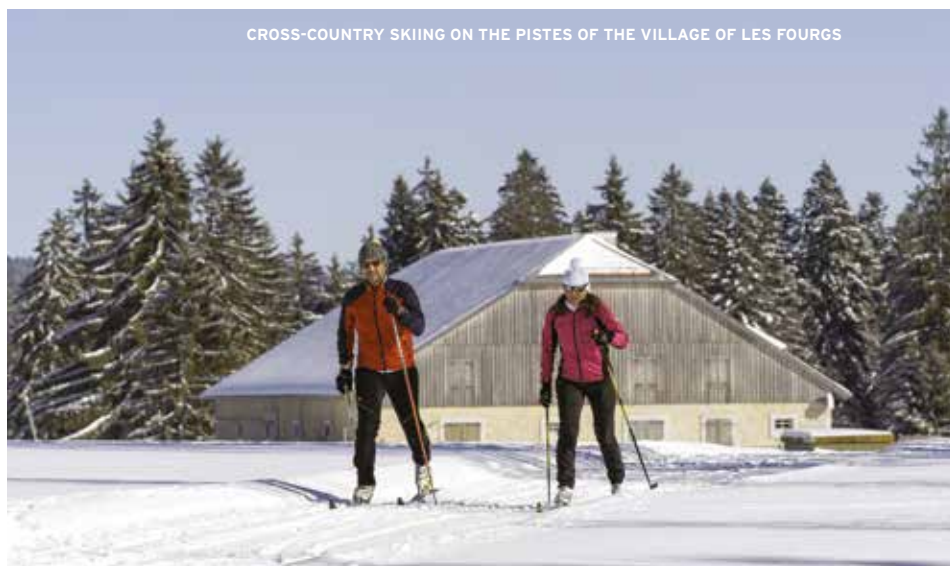
CROSS-COUNTRY SKIING ON THE PISTES OF THE VILLAGE OF LES FOURGS

Cross-country skiing pistes: 120 km Show-shoe pistes: 120 km Dog sledding: yes Downhill skiing: yes / 9 ski lifts, 2 rope-tow lifts Ski school: yes - the Gardot sector Fun zone: yes Altitude: between 870m and 1,000 metres