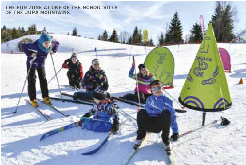
THE FUN ZONE AT ONE OF THE NORDIC SITES OF THE JURA MOUNTAINS

In the very heart of the Jura Mountains, set off to explore fabulous scenery that is worthy of the Canadian Far North. This is the kingdom of wide-open spaces and cross-country skiing, but also home to a succession of little villages flanked by high forests, snow-capped meadows and frozen lakes. Just along a trail you may be able to see dog-sledding teams as they practice.